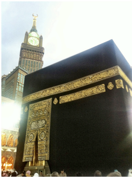
The Ka'ba inside the grand mosque, with the Abraj Al Bait Towers in the background. Photo - Dustin Craun, 2013

sion with gigantism to such extremes that, "he seems to have imprinted Scott and Venturi's bible of hyper-reality, Learning From Las Vegas , in the same way that pious Muslims memorize the Qur'an ." 53 One of the grossest manifestations of this striving for Humanitas is the Burj Dubai, now the tallest building in the world, which when completed will stand 2600 feet tall and will have the world's largest shopping mall, with an area equaling more than 12 million square feet, at its base. This, along with the holy city of Mecca undergoing rapid redevelopment with the biggest (in terms of square feet) and second tallest building in the world, the Abraj Al Bait Towers , directly outside of the Grand Mosque, as the most explicit example.