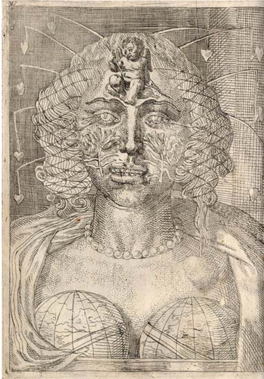
Figure 2. An illustration of "sonnet" beauty in Charles Sorel's The Extravagant Shepherd (London, 1654).